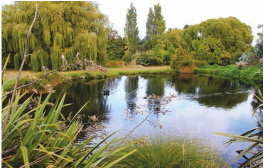
Protected lake: Water adds tranquility.