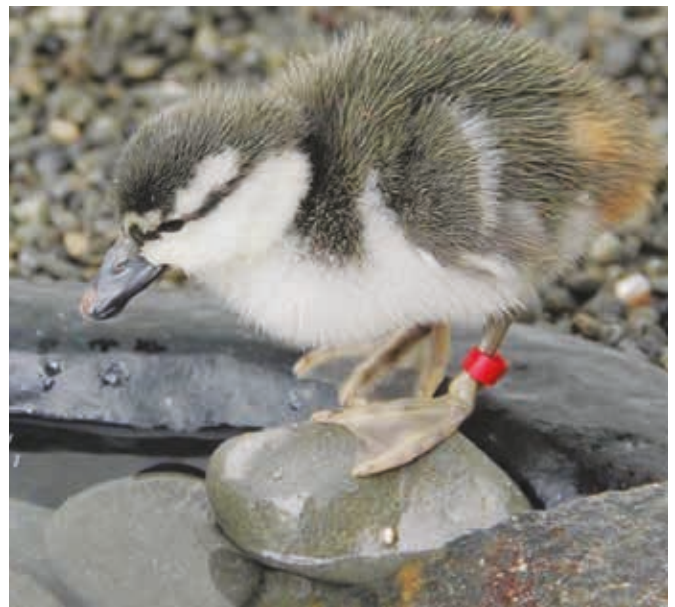
Very cute: Did they survive?