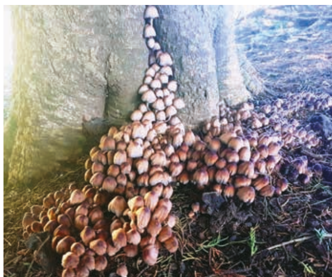
Fascinating fungi: A rare sight.