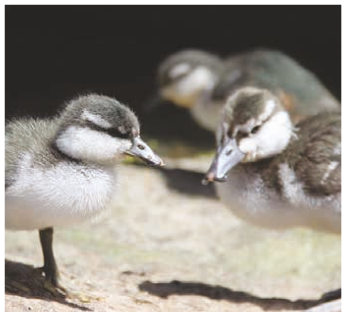
Sharing: Hope they made it through.