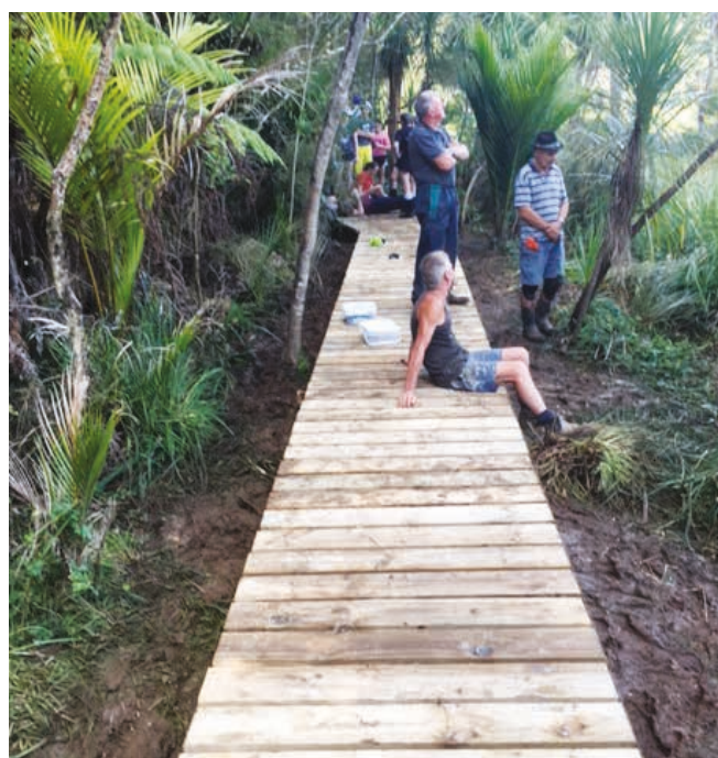
Whew: Time to rest, work over.