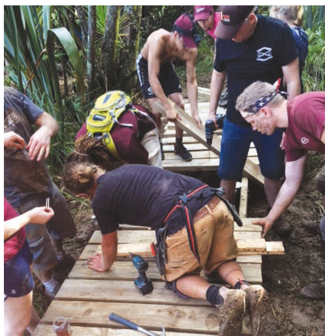
On the job: Boardwalk working late.