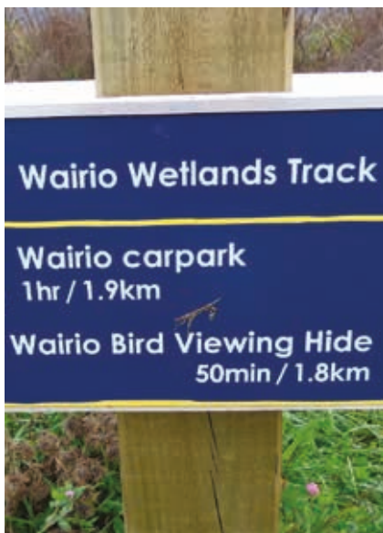
Instructions: Finally, an actual notice-board.