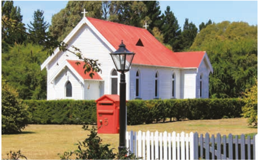
Church: St Ita's built 1911, came from Hinds in five pieces then fully restored on site.