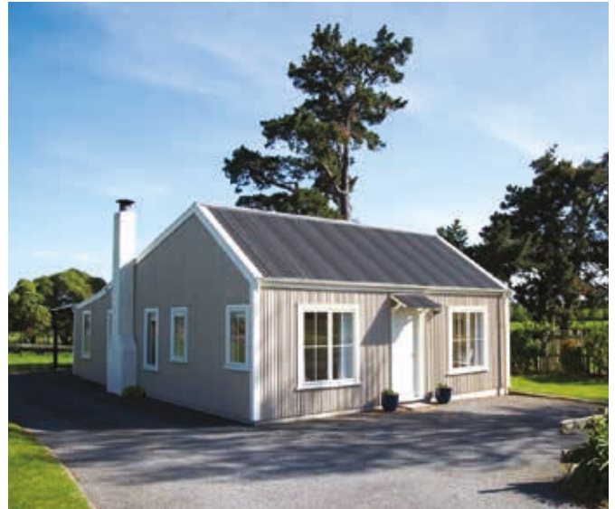
Cottages: A touch of romance.