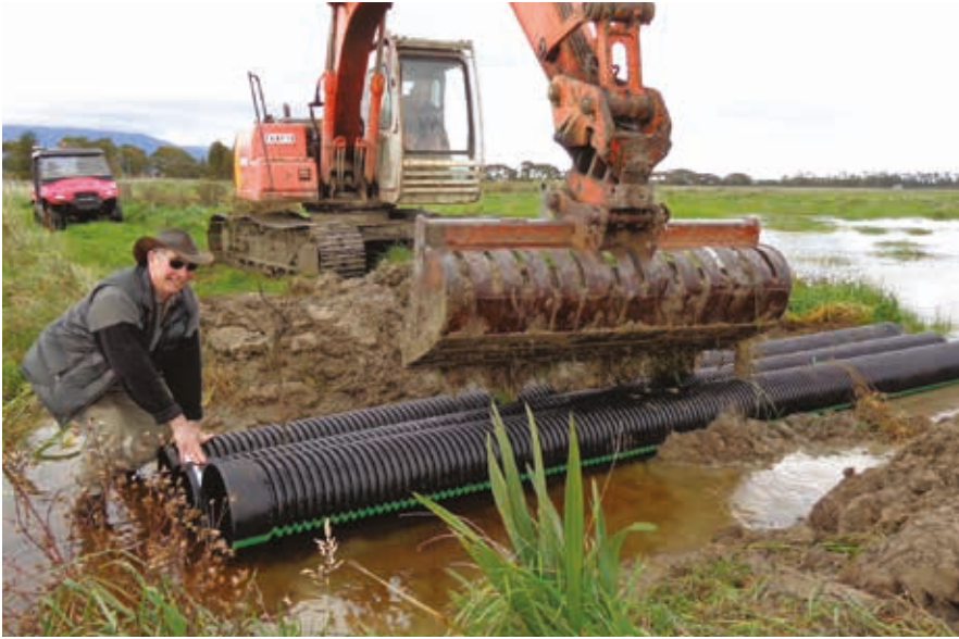
Essentials: Putting in the pipes.