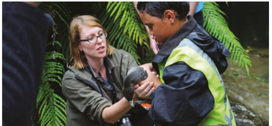
Community release: – Members of the local community get involved with the release.