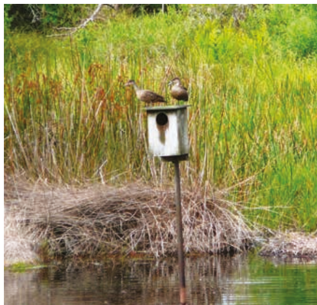
Nesting boxes: Fifty nesting boxes keep ducks happy.