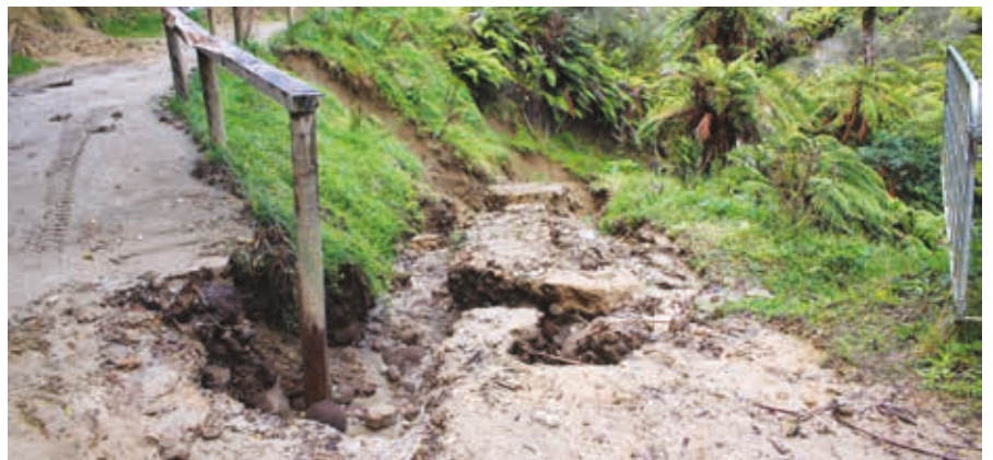
Waterfall damage: Track damage at Blue Duck Falls, site of the release.