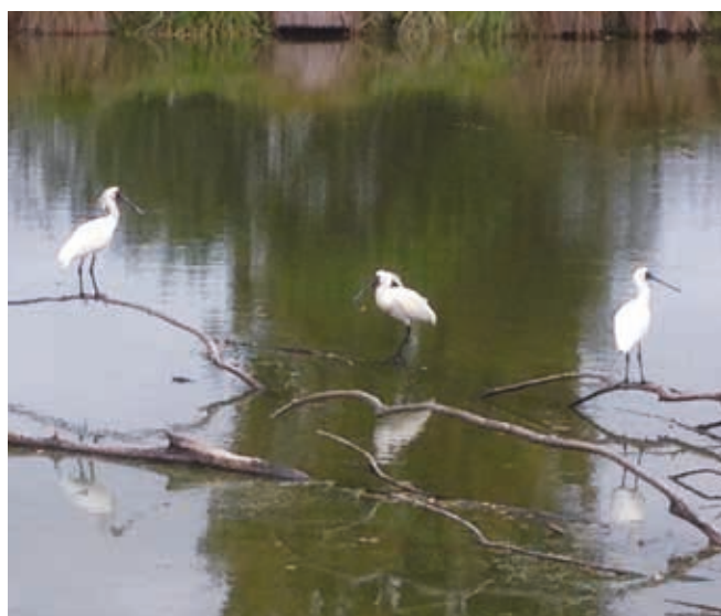
Reflections: Spoonbills at Pohangina wetlands.