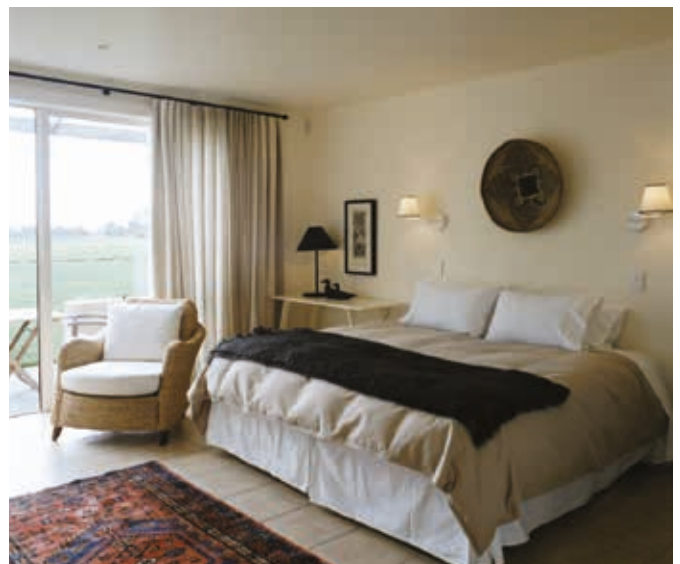
Studio: Luxurious comfort.