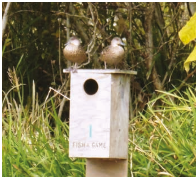
Grey Teal 1: Good spot – Fish and Game.