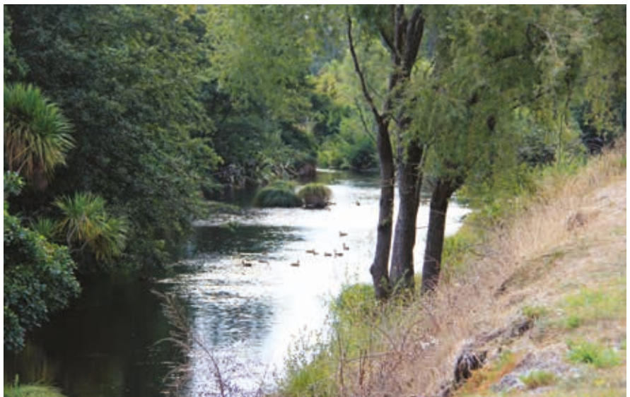
More inviting water: Yet another restful setting.