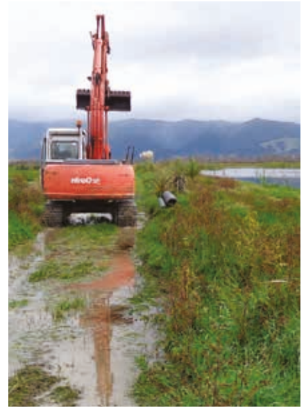
Heading home: Trusty digger – job done.