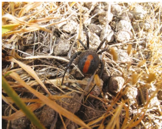
Redback: Not nice spider.

“What we were able to show in our research was that filling in those rabbit holes was an effective way of eliminating the presence of the redback spiders at the treated sites, and therefore reducing the rate of the chafer beetle being preyed upon.”