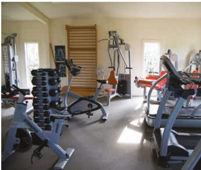
Exercise: Work out time.