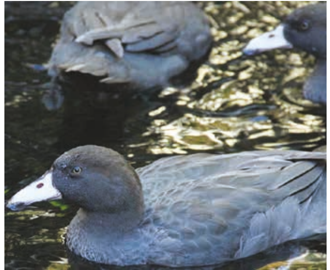
Old enough: Adult whio.

The Isaac Conservation and Wildlife Trust