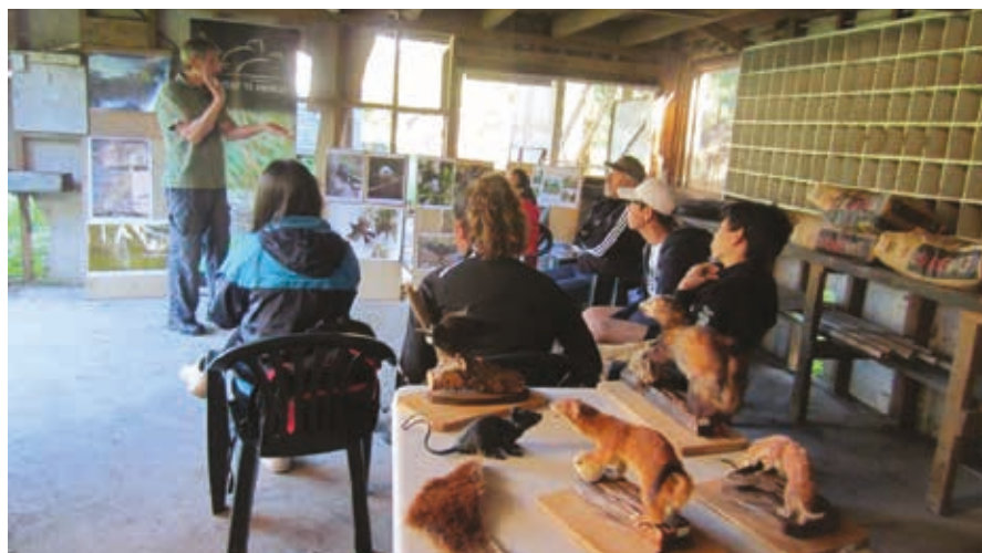
Wetland education: First wetland talk in the old barn.

Carrying tools, timber and a large generator almost a kilometre along the riverbank to