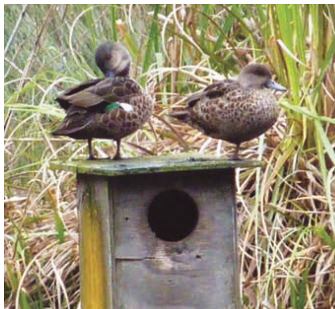
Grey Teal 2: Another nesting box in use.