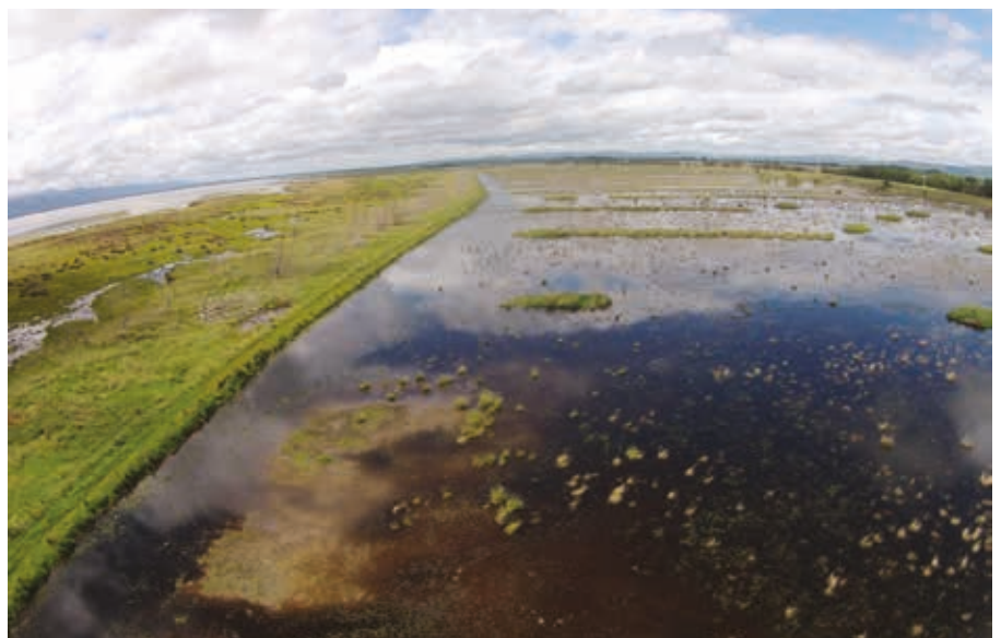
A Round world: From the air. Photos taken in April.