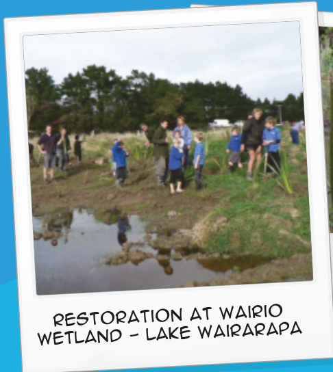
RESTORATION AT WAIRO WETLAND - LAKE WAIRARAPA

WE WILL FIND A LITTLE TREASURE FOR THE EDITORS PICK! SEND TO CONTACT BELOW.