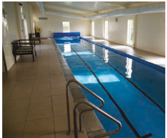
Pool: A lap before dinner.